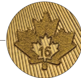
LASER MARK MICRO-ENGRAVING WITH BULLION DNA ANTI-COUNTERFEITING TECHNOLOGY